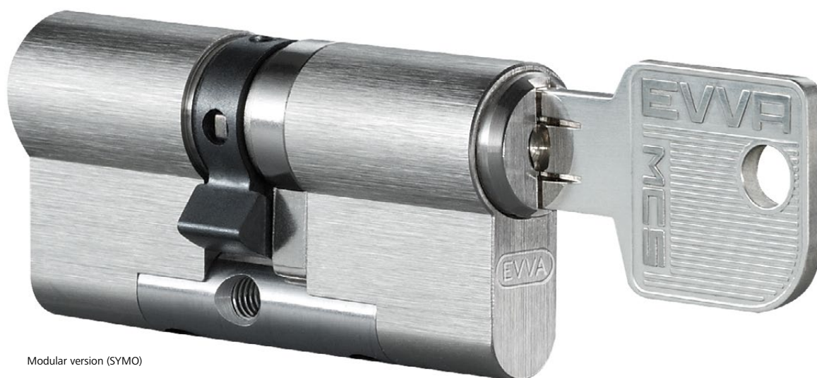
Modular version (SYMO)